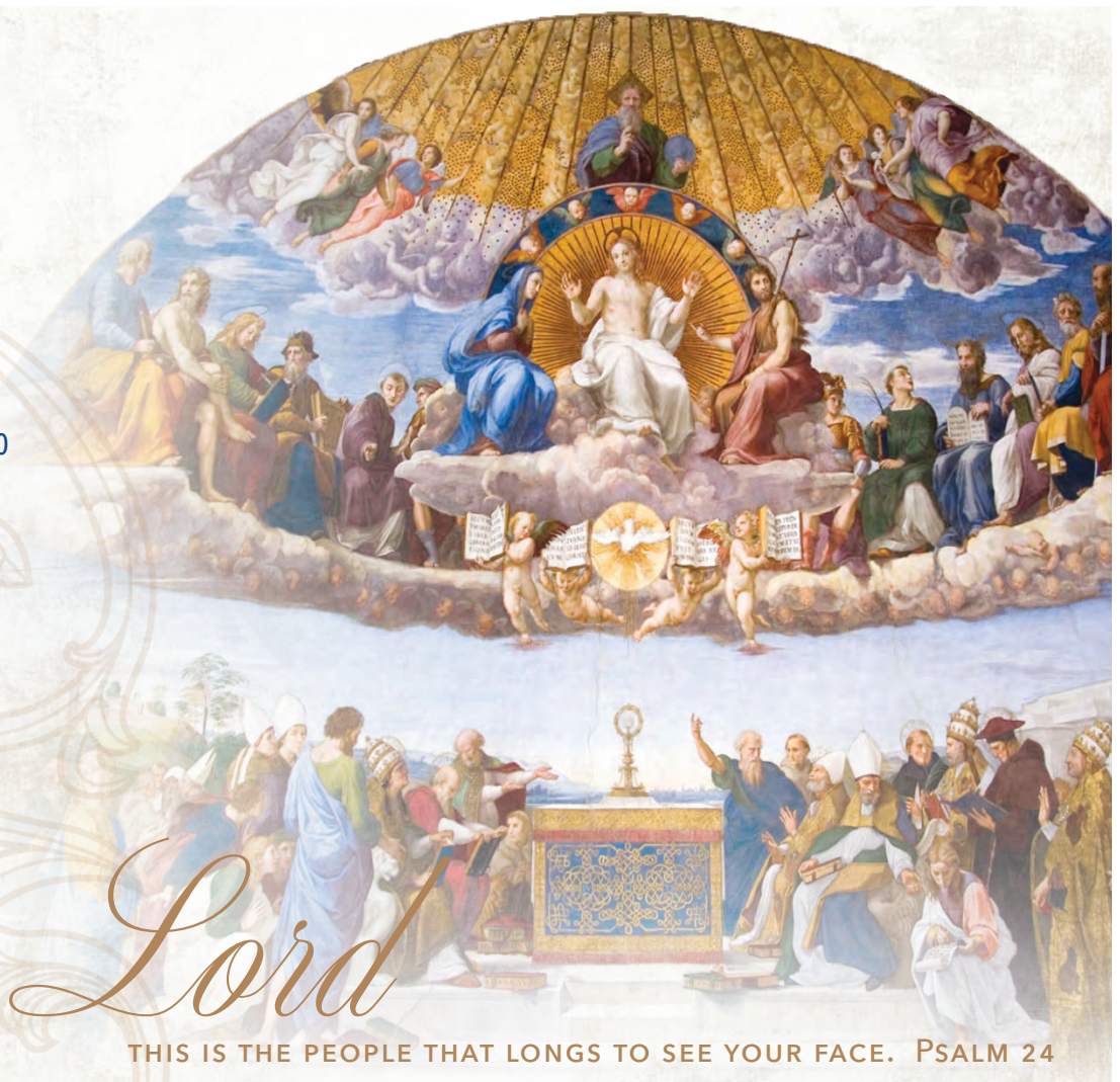
Disputation of the Holy Sacrament, Raphael (1509-10)

1899 McCoy Road Columbus, Ohio 43220 Parish Office (614) 451-4290 www.standrewparish.cc