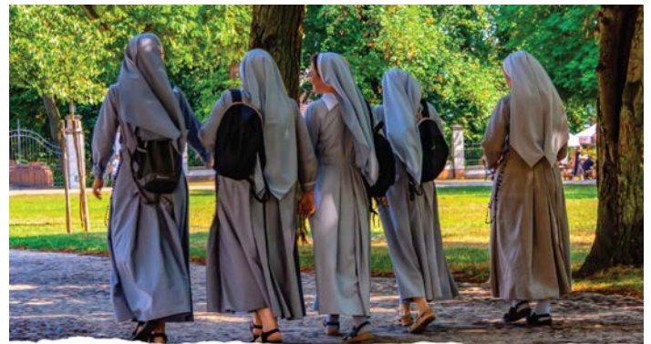
Sponsored by Serra Club of North Columbus