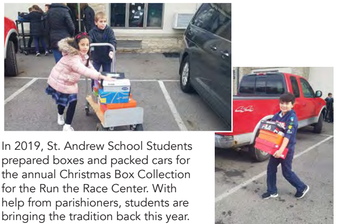
In 2019, St. Andrew School Students prepared boxes and packed cars for the annual Christmas Box Collection for the Run the Race Center. With help from parishioners, students are bringing the tradition back this year.