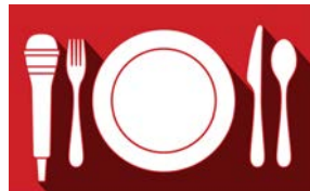
CATHOLIC MEN'S LUNCHEON CLUB

Please DO NOT send any requests or updates to any individual staff member as your request may not be received and published.