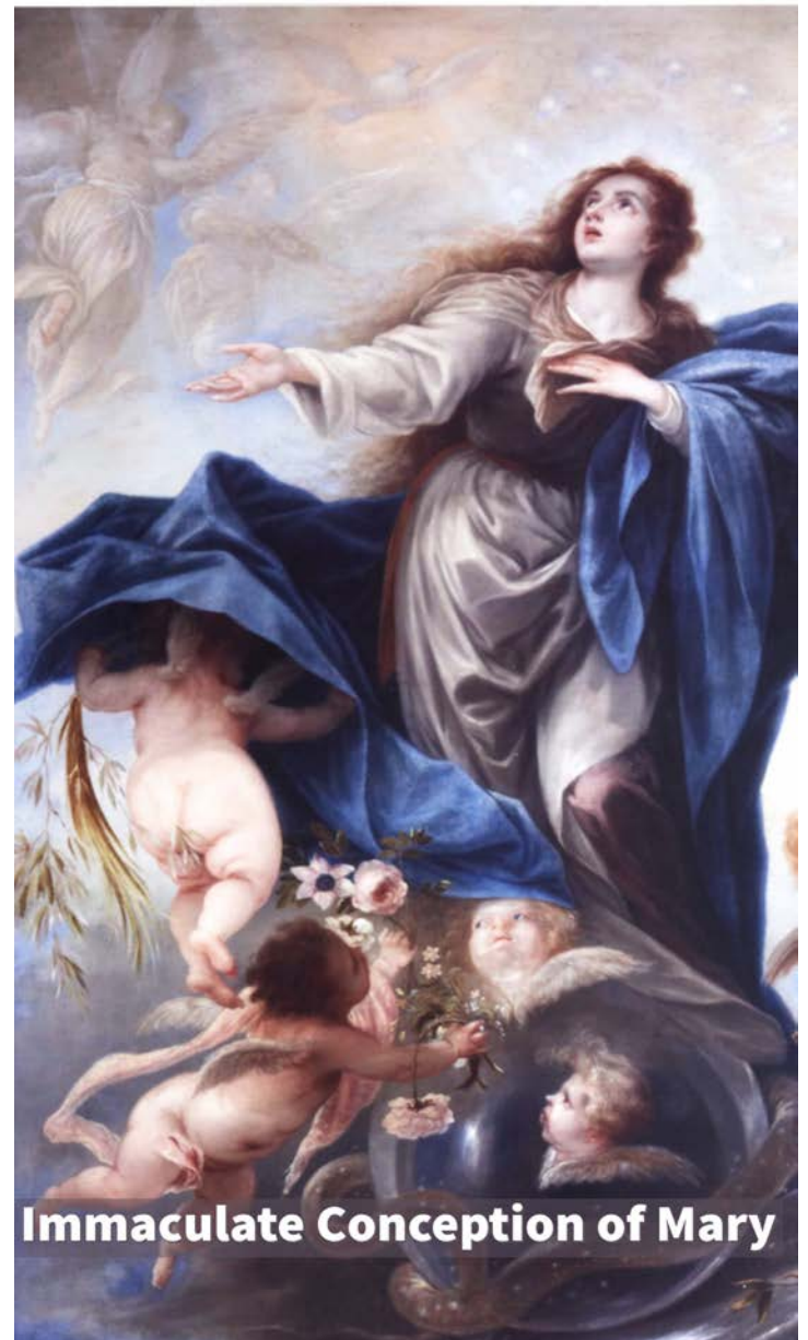
Immaculate Conception of Mary

You can also send a check directly to St. Andrew Parish with BAA marked in the memo section. Please pray for the success of the Appeal and remember no amount of giving is too small. Thank you for your generosity.